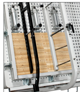
Fixed and sliding front clamp.