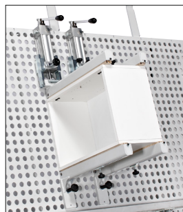
Extensions for assembling furniture parts.